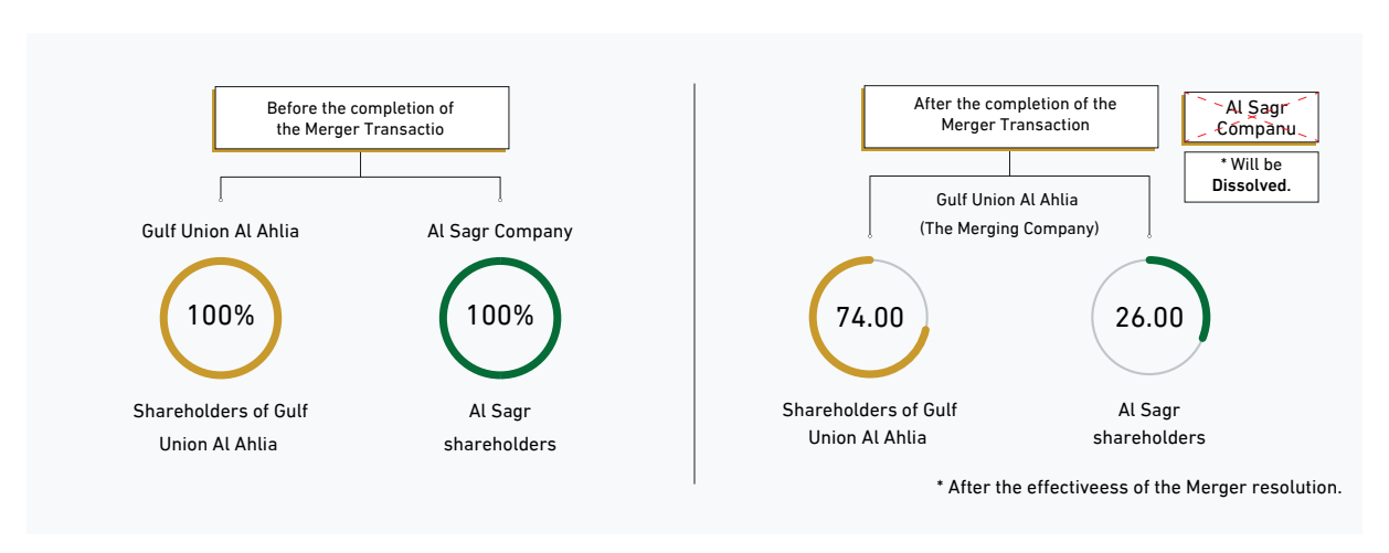
Figure 2.1: Simple Form of Merger Transaction Structure

Gulf Union Al Ahlia has appointed Aljazira Capital as financial advisor in connection with the Merger Transaction. A Simple Form of Merger Transaction Structure is provided below.